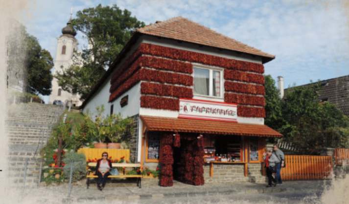
Pepper house at the Balaton

Day 12 A day out at the Plitvice Lakes. Arranged in cascades, the lakes really are an area of natural beauty with a rich diversity of flora and fauna. And countless waterfalls. Although one of the main tourist attractions in Croatia, we show you how to enjoy your day mostly away from the hustle and bustle.