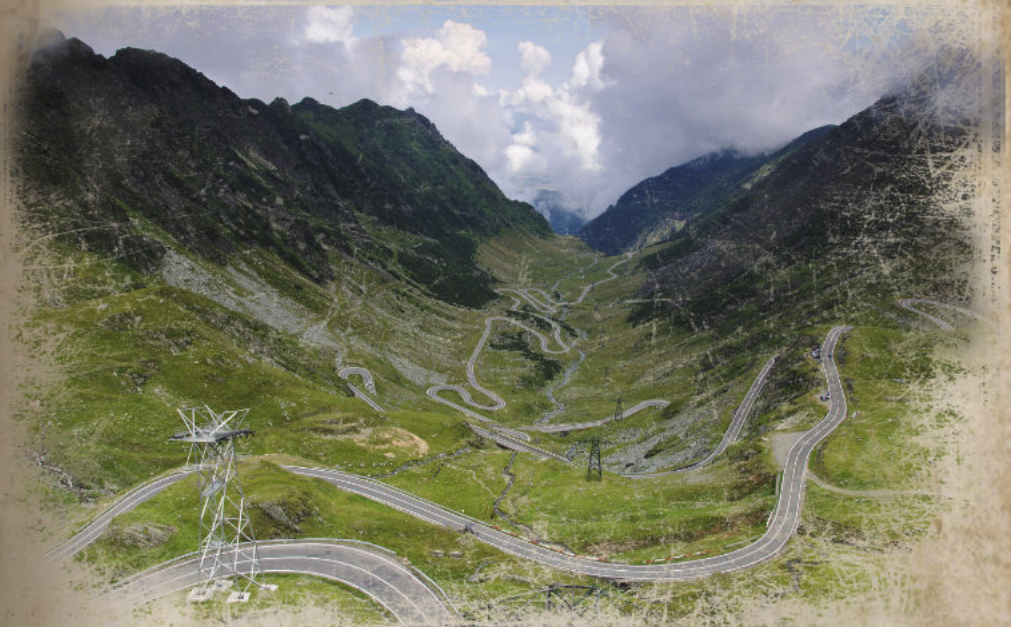
Roller coaster mountain pass in the Carpathians