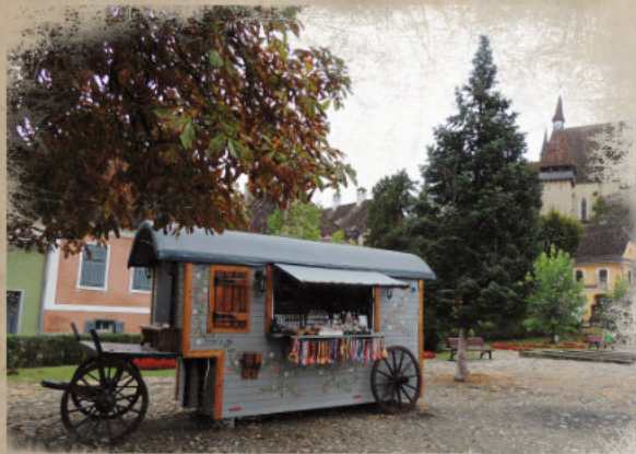
Marketplace with fortified church

and a guided night tour will reveal all the secrets of this UNESCO site.