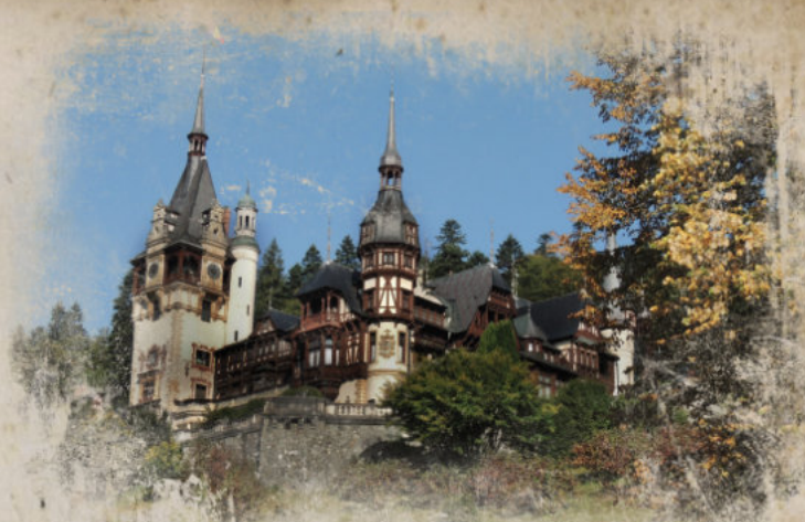
Castelmania in Romania

Day 28 Budapest is ahead. Before we arrive there we will visit a living traditional settlement of the Palócz subgroup within the Hungarian nation, a