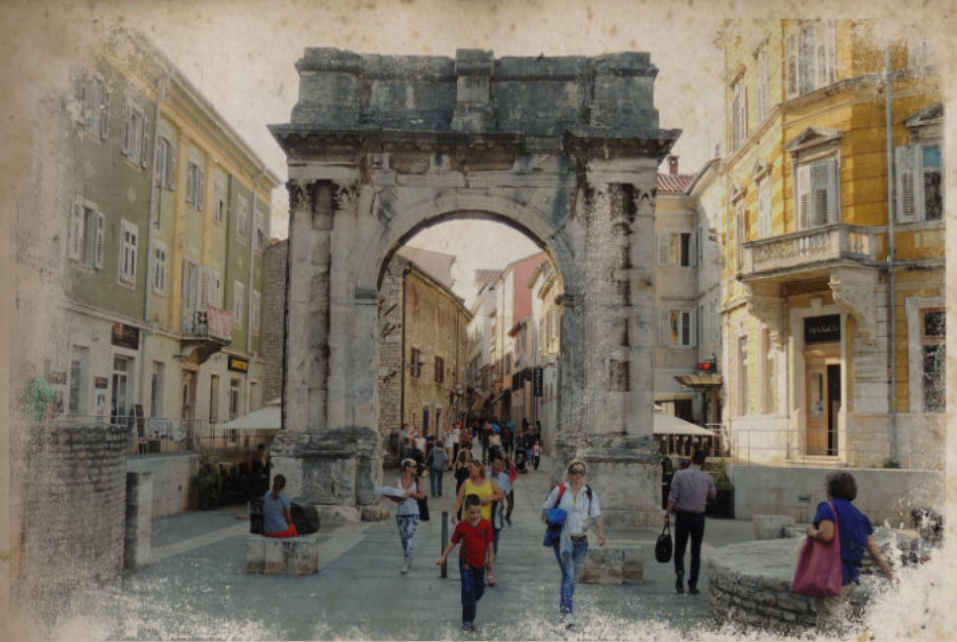
Roman remains in Croatia

Bohemian rhapsody: Český Krumlov in the Czech Republic